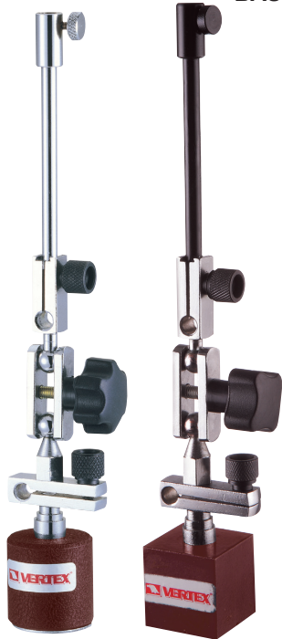
ORDER NO. VH-70 MINI MAGNETIC BASE ROUND BASE OR SQUARE BASE